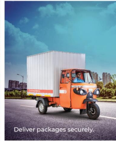
Deliver packages securely.