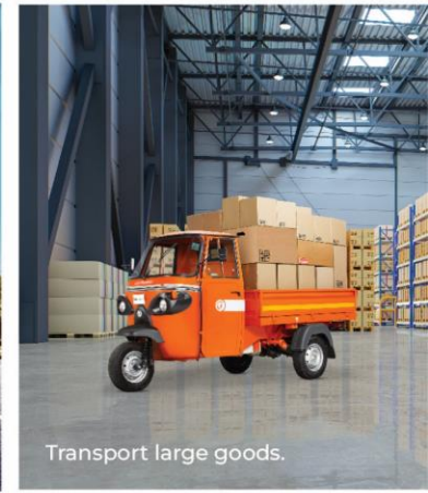
Transport large goods.