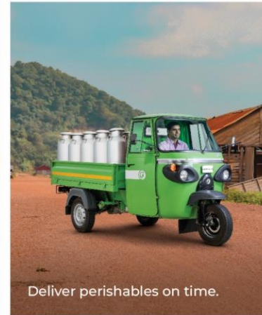
Deliver perishables on time.