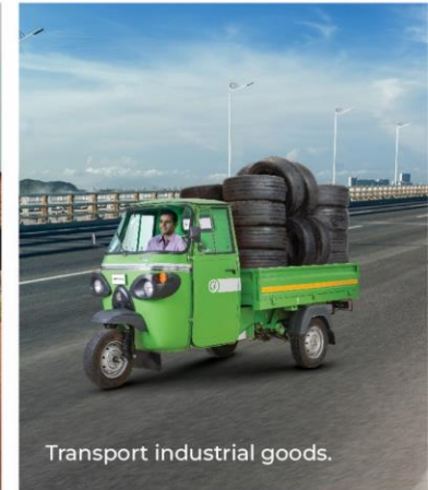
Transport industrial goods.