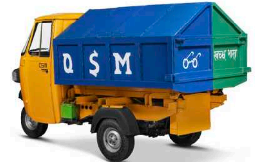
RAGE+ GARBAGE TIPPER